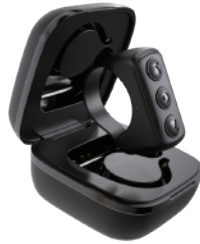
Remote control (x1)