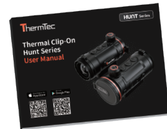
User manual (x1)